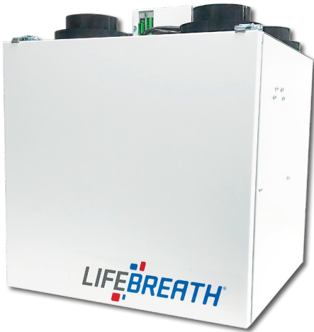
RNC 88 91 CFM @ 0.3 (75) IN. W.G. (PA)