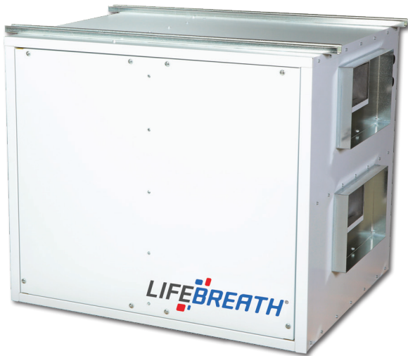
455 DD / 455 FD