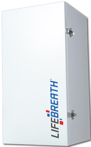
TFP 3000 HEPA RTO