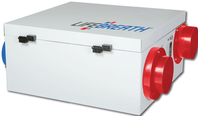
METRO 120 ERV 129 CFM @ 0.3 (75) IN. W.G. (PA)