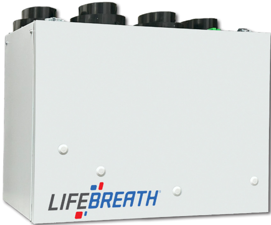
RNC6-ES 163 CFM @ 0.3 (75) IN. W.G. (PA)